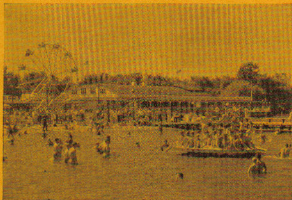
(A view of one of the many resorts)

Lake Shafer extending 10 miles north of Monticello, Indiana . . . Lake Freeman, extending 7 miles south of the city . . . two unspoiled lakes with the charm of wooded shore lines, famous as the shores of the historic Tippecanoe River. Since the days of the Pottawattomie Indians and the coming of the first settlers to the region, the Tippecanoe River, from which Lakes Shafer and Freeman are formed, has been reputed to be the best fishing waters in the state. The lakes are constantly restocked with fish by local and state hatcheries.